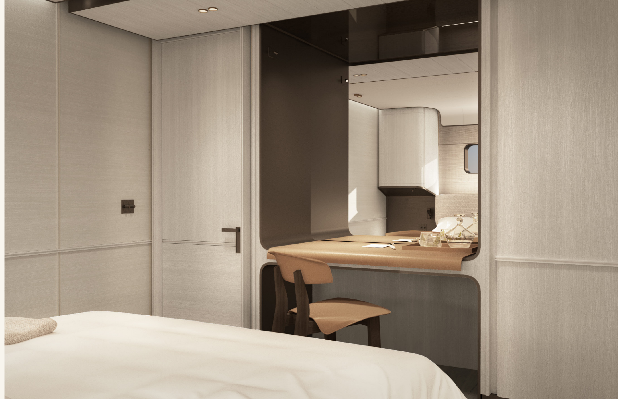
LD Guest Cabin