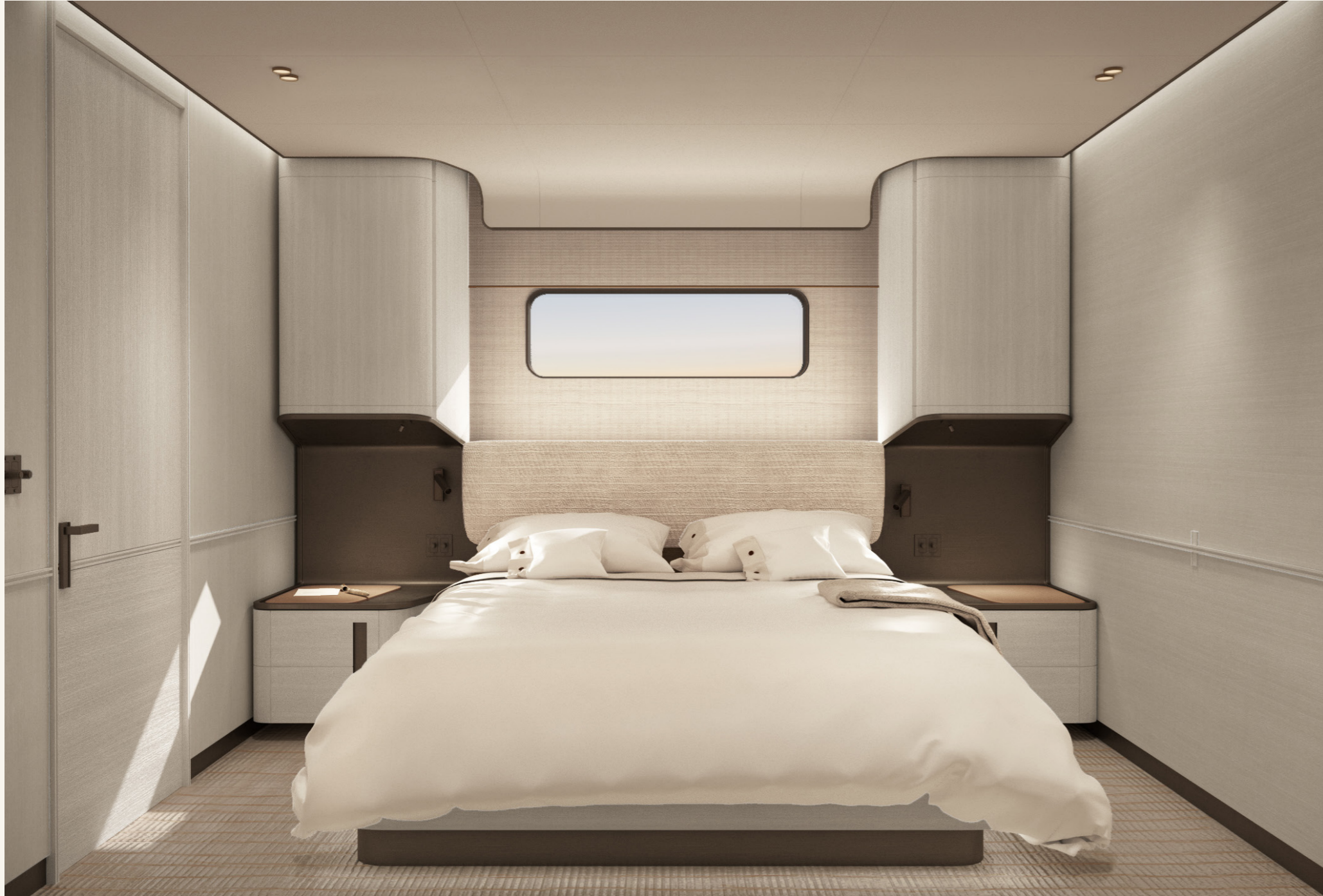
LD Guest Cabin